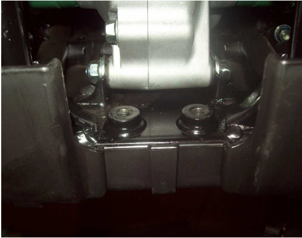
Stock hitch location holes