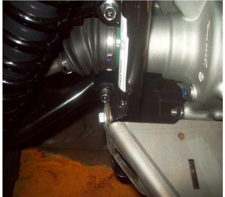
Receiver hitch installed and top mounting locations